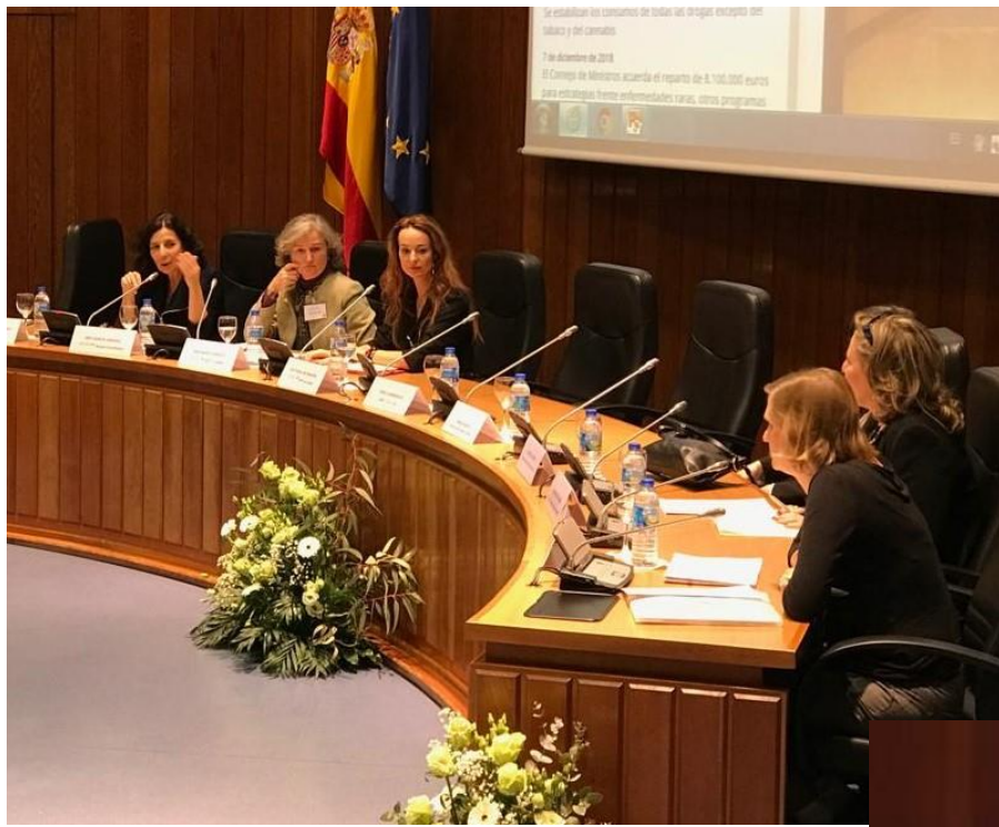
Plenary session: Making it Happen