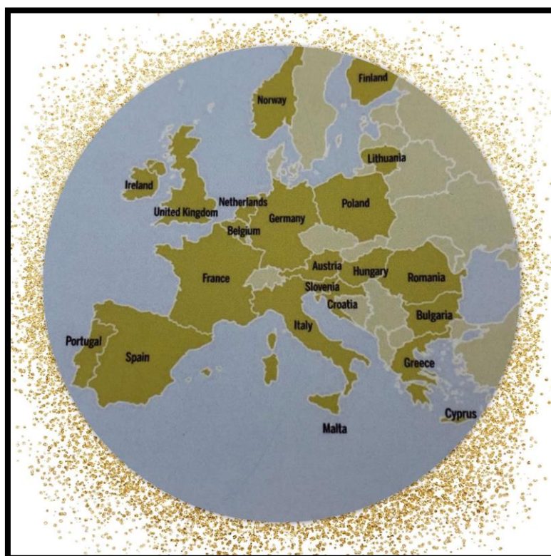
The ADVANTAGE JA Madrid Forum. 13th December 2018. Evaluation Report